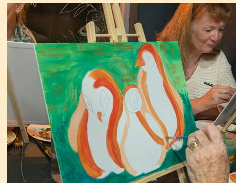
A Very Croydon Christmas Painting