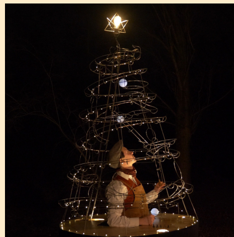
Matt Pang's Curiosity Christmas Tree