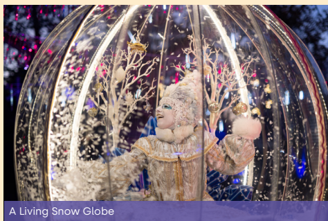
A Living Snow Globe

All events take place in and around Croydon Clocktower, Katharine Street, CR0 1NX or on the High Street.