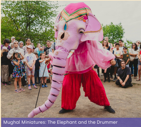
Mughal Miniatures: The Elephant and the Drummer