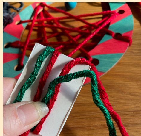
Lucky Horseshoe Workshop

Sun 1.30pm – 2pm, 3pm – 3.30pm & 4.30pm – 5pm High Street and North End