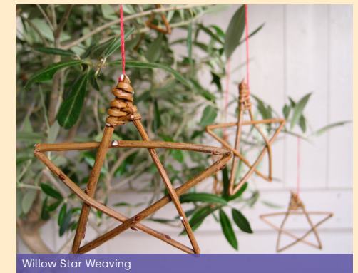
Willow Star Weaving

Croydon Creative Enterprise Zone, LG Centrale, 21 North End, CR0 1TY